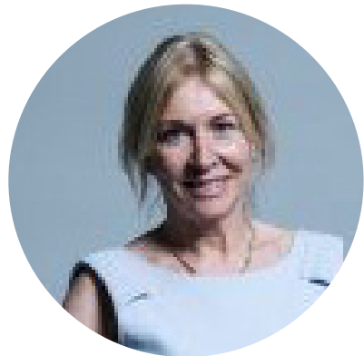
The Rt Hon Nadine Dorries MP Former Secretary of State for Digital, Culture, Media and Sport